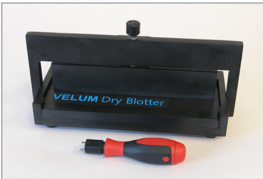
Fig. 1a. VELUM Dry Blotter