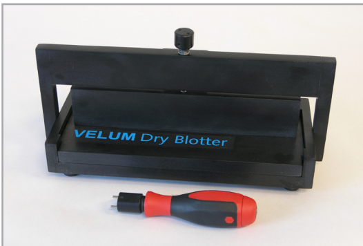
Fig. 1a. VELUM Dry Blotter